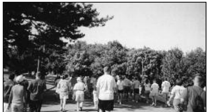
Participants at the NAMI event begin the 3.1 mile walk in Forest Park