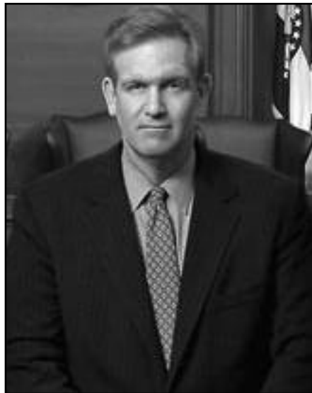
Missouri Attorney-General Jay Nixon

The Attorney General also emphasized that disparities continue to remain in both outpatient and inpatient psychiatric treatment. He stated that the Government should not undervalue health services provided to those with mental illness (compared to physical illness), stating that "mental health parity is long overdue". He outlined three major goals for